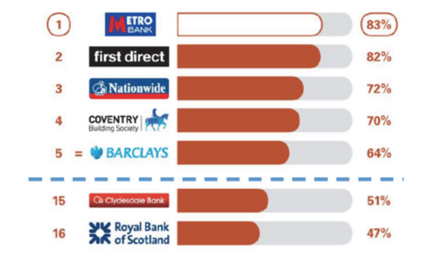
Business Current Accounts: Overall Quality of Service(1)