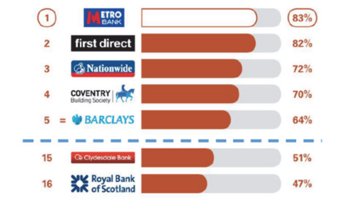
Personal Current Accounts: Overall Quality of Service<sup>(1)</sup>